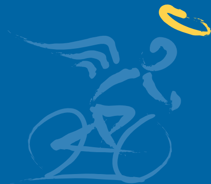
Illustration & Design by Steven Plaziak Design >>>>> www.plaziak.com

Stay at The Hole In The Wall Gang Camp on Saturday night!